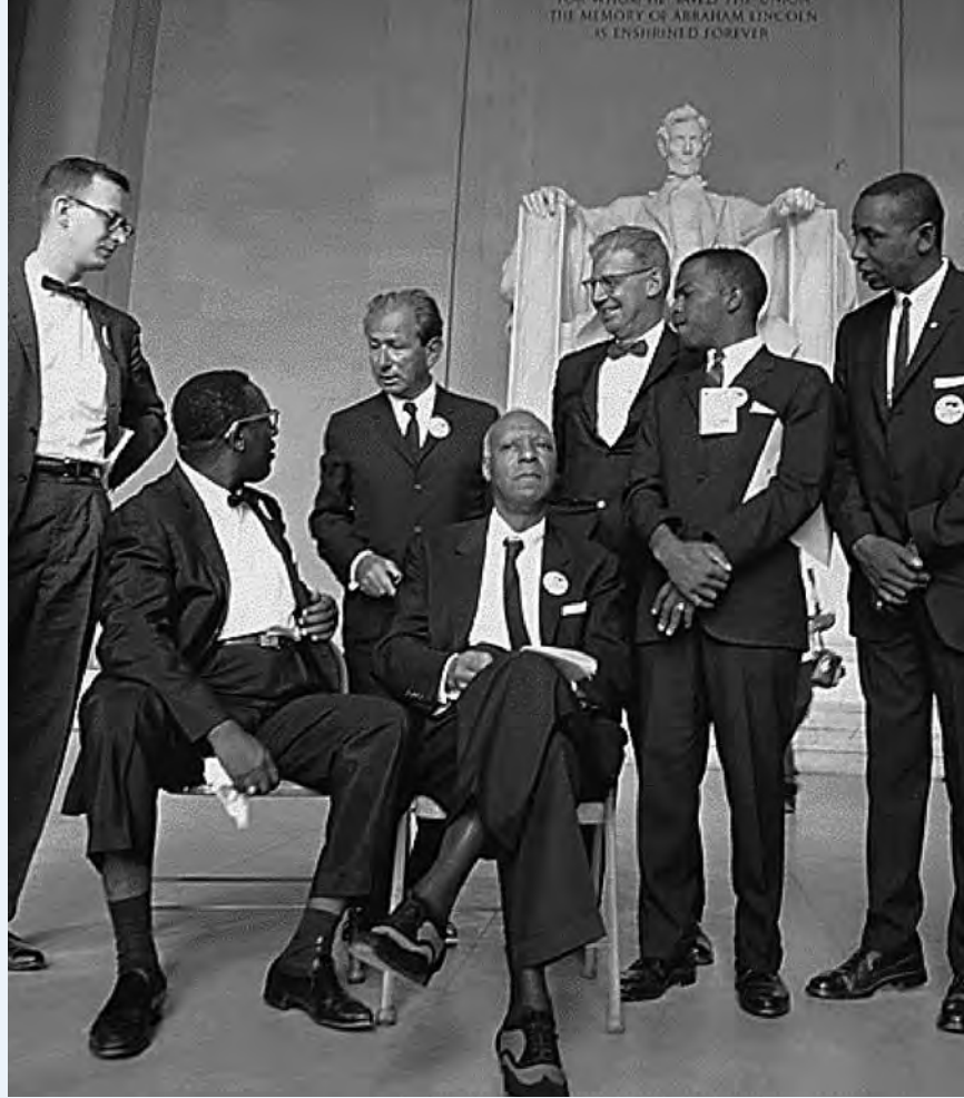
Several march leaders talk to one another in the shadow of the Lincoln Memorial. Seated in the middle is A. Philip Randolph, veteran labor leader and the march's official organizer.

country! Let us work in our country!"), and singing labor songs ("Which Side Are You On?"). President Franklin D. Roosevelt would look through the White House windows to see the greatest gathering of blacks ever—all protesting his administration. Plans called for long lines of marchers walking to the muffled drums of a funeral procession.