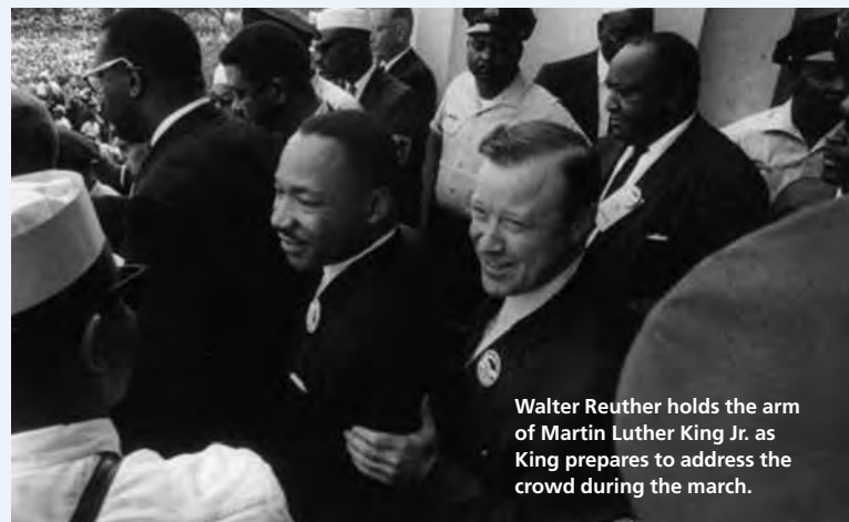
Walter Reuther holds the arm of Martin Luther King Jr. as King prepares to address the crowd during the march.

For years, Reuther had made civil rights a central part of his politics. Labor unions were almost as lily-white as southern schools and Sunday church services. Workers in factories, mines, and furnaces and at construction sites often considered civil rights a