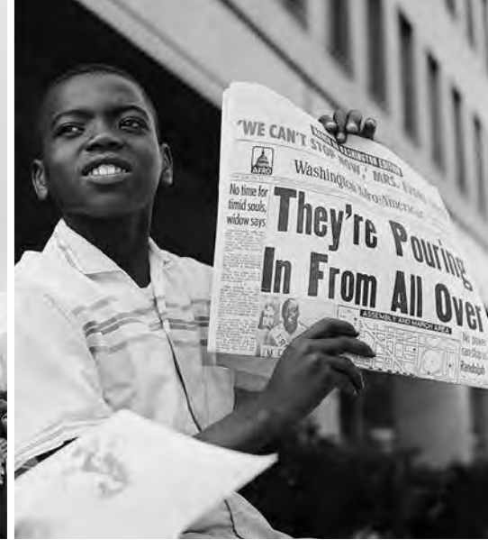
Above left: A man carries his daughter on his shoulders during the march. Middle: Marchers cheer after King speaks. Right: A paperboy holds up a newspaper announcing the event.

or public accommodations as long as millions of American Negroes are treated as second-class economic citizens and denied jobs.” According to the New York Times , “Harshest of all the speakers was John Lewis,” the 23-year-old chairman of the Student