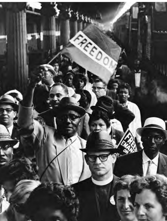
At right: A. Philip Randolph, president of the Brotherhood of Sleeping Car Porters; Roy Wilkins, executive secretary of the NAACP; and civil rights leader Anna Arnold Hedgeman plan the march route and discuss strategy. Bottom left: Marchers arrive at Union Station in Washington, DC. Bottom right: Participants line up to board buses home after the march.